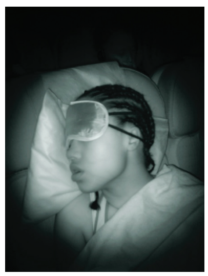
Figure 3. The journey (Hugo, 2014)

pline or control, or commercial gain. It would be difficult, anyway, to identify the individuals involved. The purpose is essentially artistic and to raise questions about photography as a surveillance tool. Even in our most unguarded moments we can easily be captured on film. There is however a moral ambiguity about these images. Is the photographer contributing to and supporting surveillance culture or is he raising questions about the morality of that culture instead? The photographer may have crossed a line about what is acceptable and may have infringed on people's privacy, even though it is for artistic purposes. I will explore the privacy issues and the wider moral dilemmas that photographers face later in this paper.